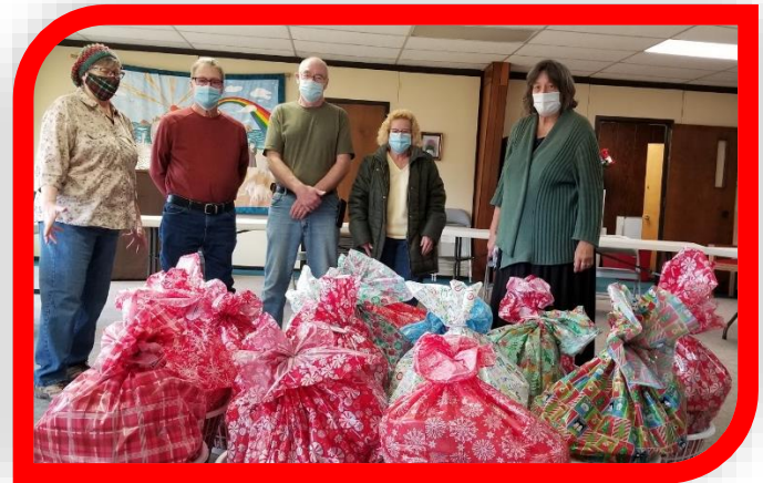
SANTA'S HELPERS – THANK YOU DEACONS AND EVANGELISM AND OUTREACH